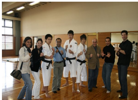
SHSU Faculty and Students at Momoyama University