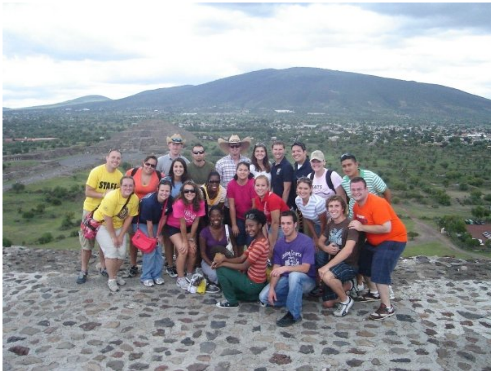
Puebla Summer Field, 2009

This was another successful year for the Study Abroad Program in Puebla. As in previous years our journey was full of excitement and surprising events. The last week of April an unexpected outbreak of swine flu hit Mexico, jeopardizing the program. Fortunately, U.S. and Mexican health authorities announced on May 15 that traveling to Mexico was completely safe. We departed on June 9, as originally scheduled. We spent twenty eight days of adventure in cool weather (average temperature 80-83F) visiting new places and learning about Mexican culture.