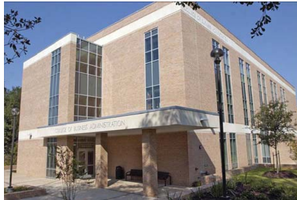
College of Business Administration, SHSU

The Department's Vision, as displayed in the left-hand column of this page, will be accomplished "with faculty that is recognized for excellence in instruction, research, and service." This issue of the newsletter, while highlighting as usual the many accomplishments of our students, faculty, and staff, pays special attention to the recent recognition that many of our faculty have received as a result of their significant