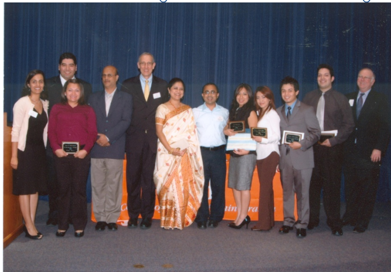
Scholarship winners and Faculty

Students and Faculty at the COBA Award Ceremony