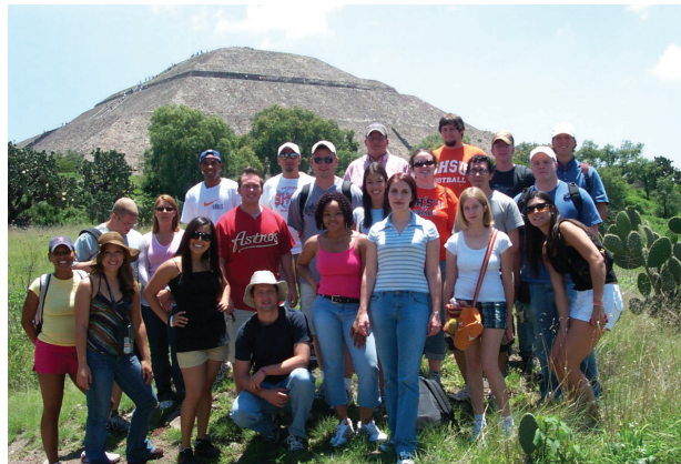
Puebla Field School, 2007