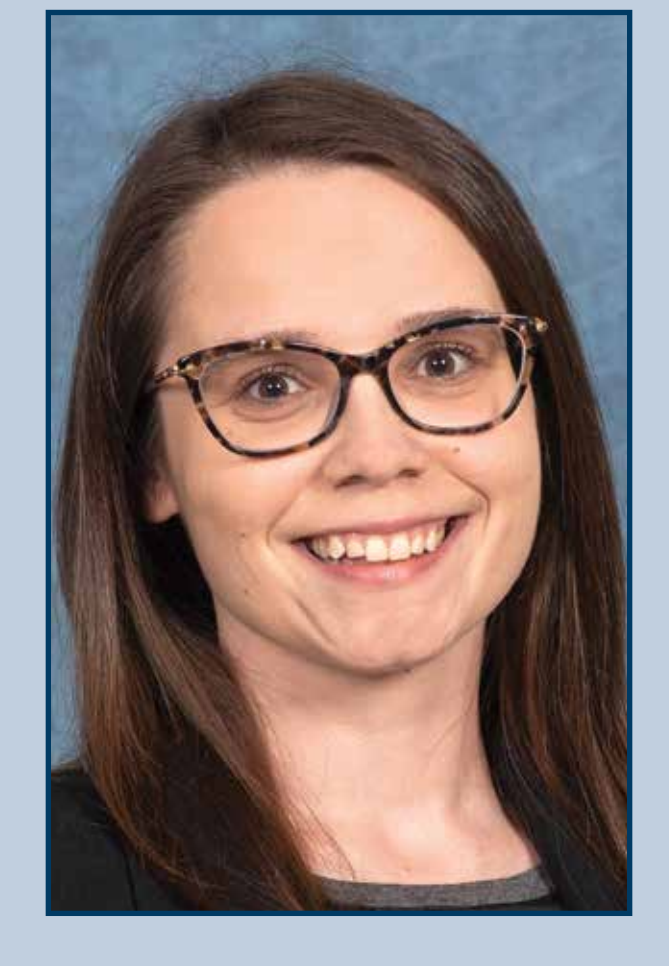
FACULTY EXCELLENCE IN COMMUNITY ENGAGEMENT

Recognizes extraordinary engagement by a faculty member own effort to support the community using their leadership efforts and expertise in the field to "build a bridge between the university and community".